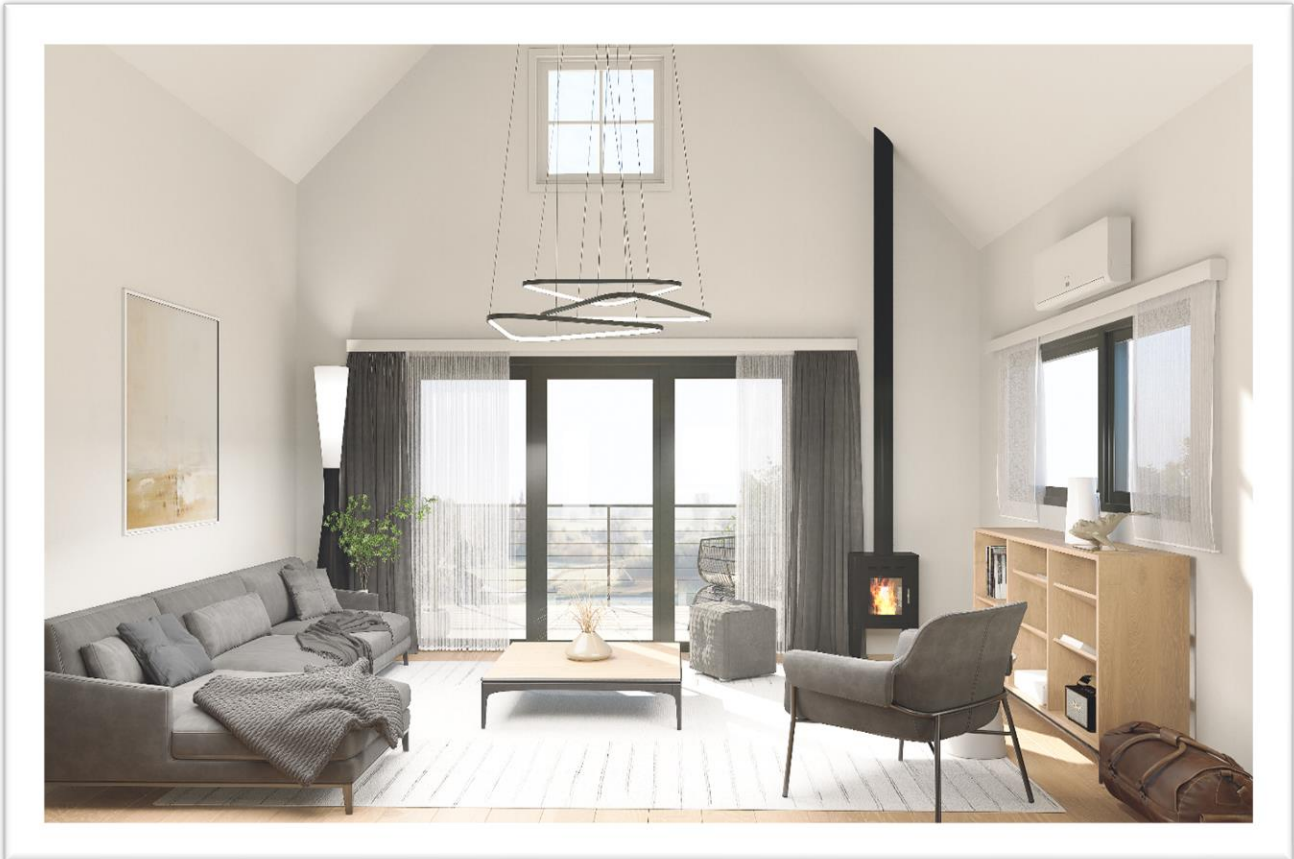
Figure 3: Kyrrland’s bright living rooms are open to the back deck and Vermont’s four-season natural beauty. The gas stove evokes comfort and convivial warmth on winter nights. Freyja’s living room features this dramatic vaulted ceiling.