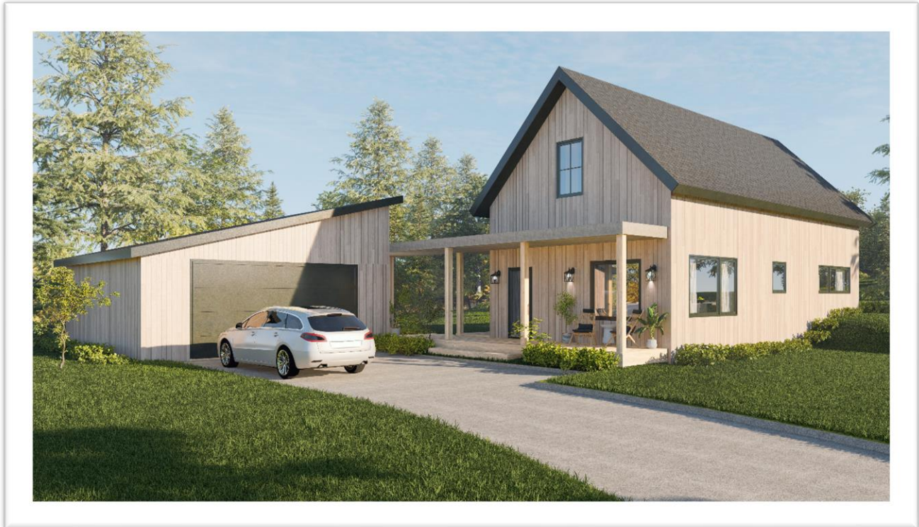
Figure 4: Homes at Kyrrland offer low-maintenance exteriors, energy-efficient Marvin windows and inspired architectural design. Björn includes this connected two-car garage with workshop and storage space.