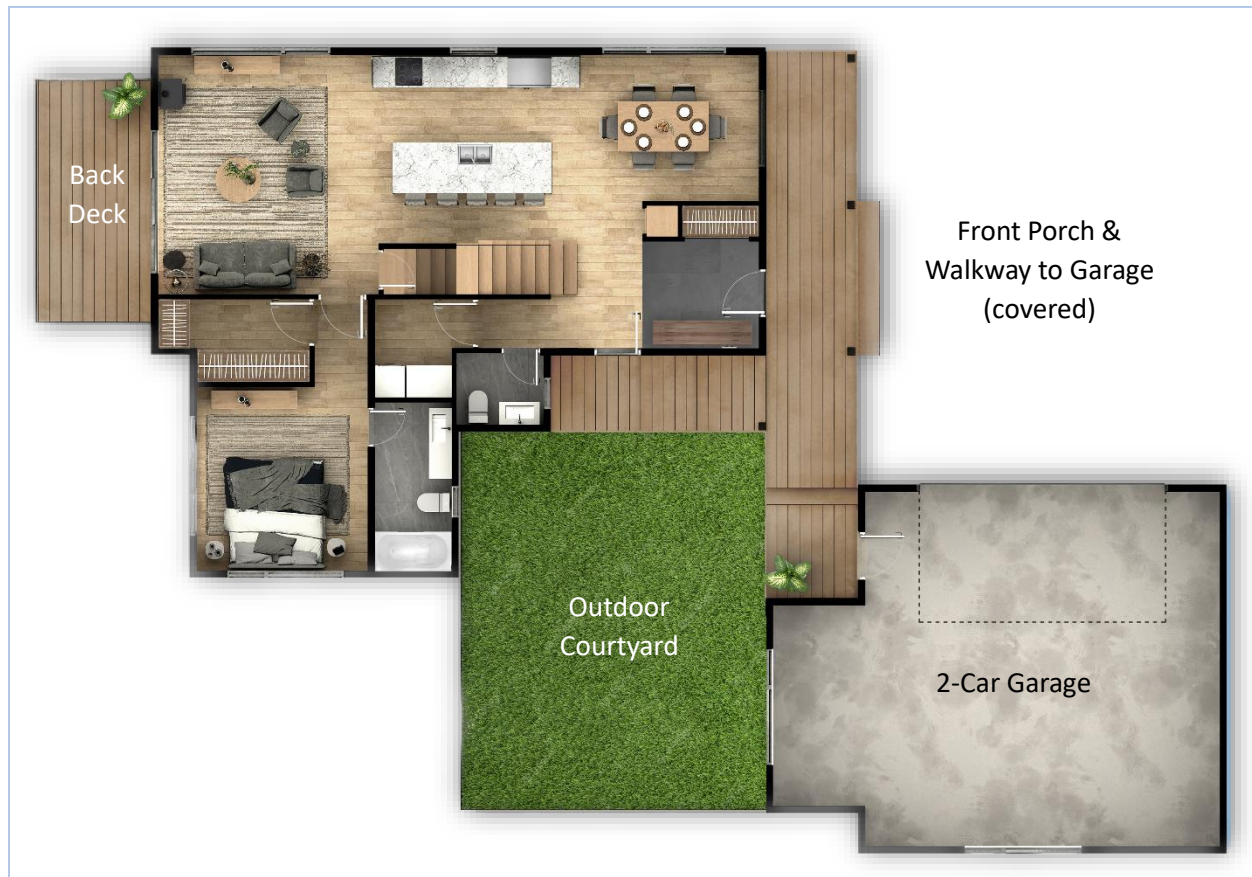
Figure 2: Main floors of Kyrrland homes feature open plan kitchen, living and dining areas that flow into front and rear decks. Primary suites include a luxurious windowed bath and a walk-in closet. Björn includes this outdoor courtyard perfect for dining or relaxing around a firepit.